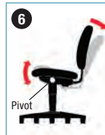
6. Tilt Pivot point located directly above center of chair base.