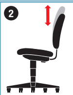
2. Back-Height Adjustment Positions lumbar support within a fixed range.