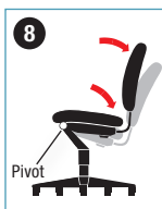
8. Knee Tilt Pivot point located near front edge of chair. Allows user to keep feet flat on floor while chair reclines.