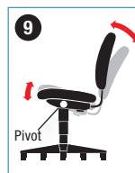
9. Dual-Action Synchro Tilt Back reclines at a 2-to-1 ratio to seat angle. Allows user to recline while keeping seat cushion relatively level to floor.