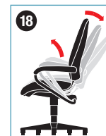
18. Inverse Synchro Tilt With automatic tension control opens torso for better circulation. "Zero lift" seat front helps keep feet on the floor when reclining. Tilt limiter controls range of motion.