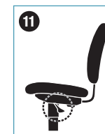
11. Tilt Lock Locks out tilt function when chair is in upright position.