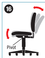
16. Dual-Clutch Posture Control Adjusts seat and back angles independently with two levers (infinite locking within a fixed range).