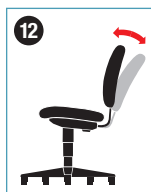
12. Posture Mechanism/Lock Back angle adjusts independently of seat, and can be locked in an infinite number of positions.