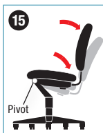
15. Synchronized Knee Tilt Back reclines at a 2-to-1 ratio to seat angle. Pivot point located near front edge of chair.