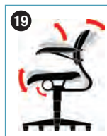
19. Independent Seat and Back Seat and back flex independently for automatic comfort