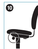
10. Tilt Tension Controls rate and ease of recline.