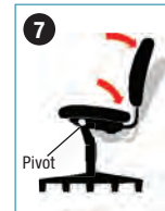
7. Mid-Range Knee Tilt Pivot point located slightly ahead of center of chair base. Allows user to recline at a slightly more relaxed angle than conventional tilt.