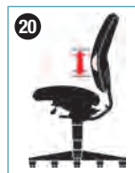
20. Integral Lumbar Support Easily adjusts to enhance comfort