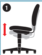
1. Pneumatic Seat-Height Adjustment Regulates height of chair relative to floor.